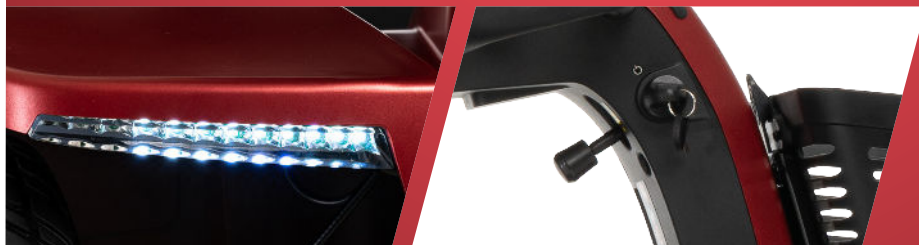
Full LED light package