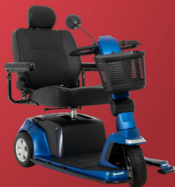
3W — FDA Class II Medical Device 1