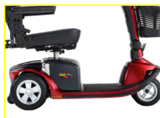
Exclusive & Stylish Low Profile Tyres