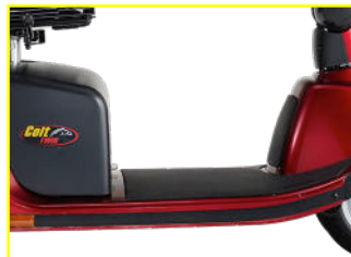
Large Amount of Leg Room