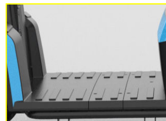
Generously sized footplate for extra room