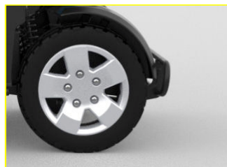
Front & Rear Suspension