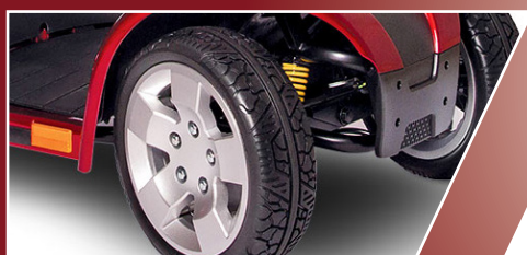
13" pneumatic tires

Luxury details, such as a continuous delta handlebar and bright LED lighting, give the Victory XL 130 a streamlined and sporty design.