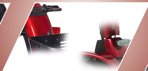
High quality design