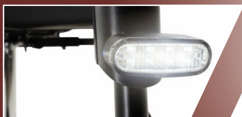
Enhanced LED lighting

This model offers everything you need for a safe and worry-free trip. Thanks to the standard 8 Ah lithium battery pack, which is permitted on an airplane, the Go Go® Endurance is ideal for long distances.